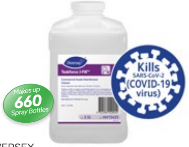
Taskforce J-Fill 2.5L