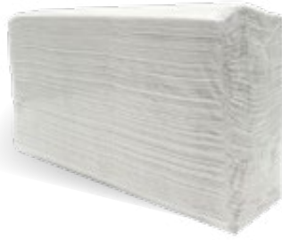
Slimfold Hand Towel 3200 Sheets