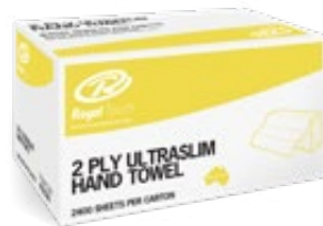
Ultraslim Hand Towel