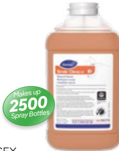
Stride Citrus Neutral HC J-Fill 2.5L