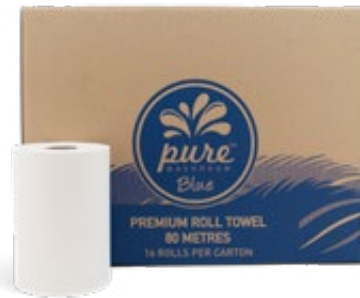
Pure Roll Towel 80m