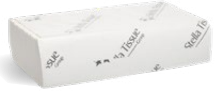
Compact Hand Towel 2400 Sheets