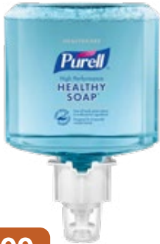
ES4 Purell CRT SOAP