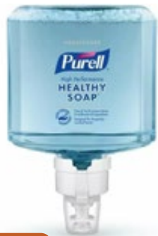
ES8 Purell Soap