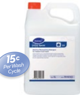
Suma Special L4 Machine Detergent 5L