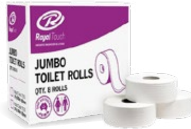
Jumbo Toilet Roll 300m