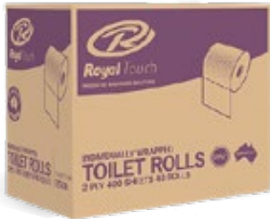
2 Ply Toilet Roll 400 Sheets