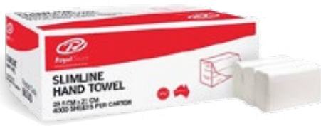
Slimline Hand Towel