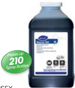
Glance Glass NA SCJ-Fill 2.5L