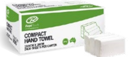
Compact Hand Towel