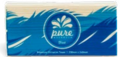
Pure Ultraslim Hand Towel 2400 Sheets