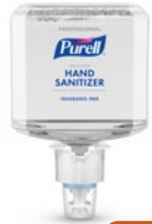
ES4 Purell Hand Sanitiser