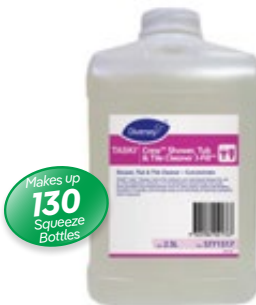
Taski Crew Shower Tub & Tile J-Fill 2.5L