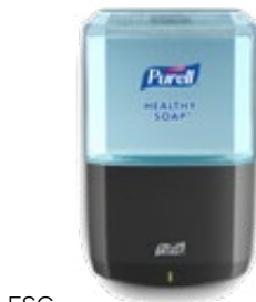
ES8 Soap Dispenser