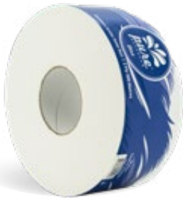
Pure Jumbo Toilet Roll 2 Ply 300m