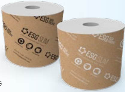
Slim Toilet Roll