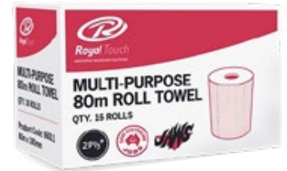
Roll Towel 2 Ply 80m