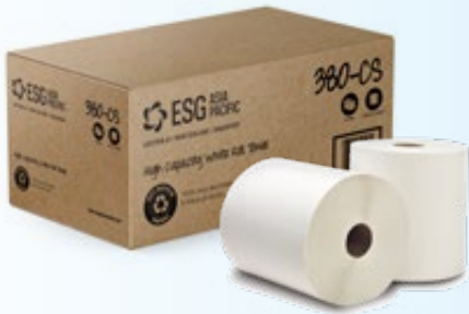
Controlled Use Roll Towel