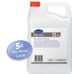
Suma Crystal A8 Rinse Aid 5L